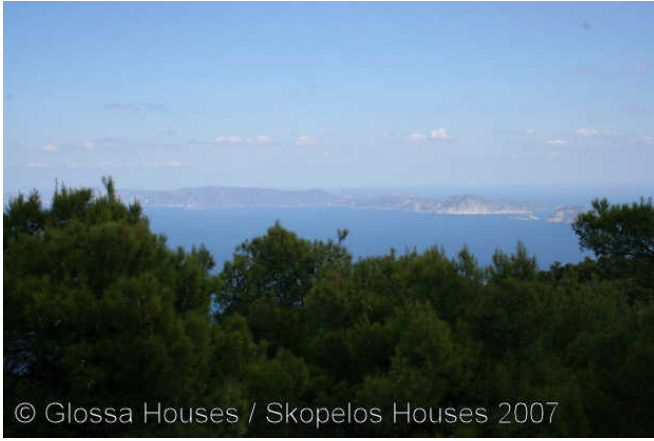
© Glossa Houses / Skopelos Houses 2007